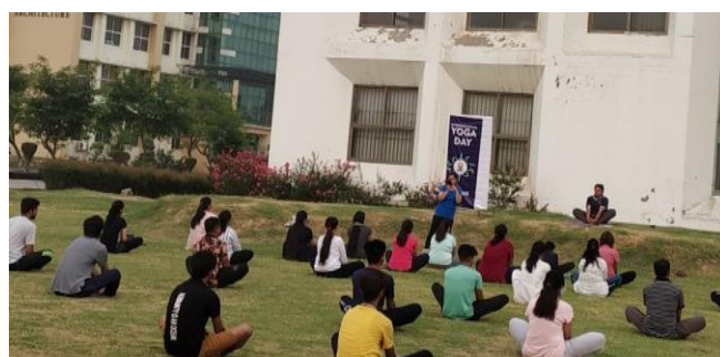
Students and Faculty members performing Yoga Aasans during International Yoga Day celebrations