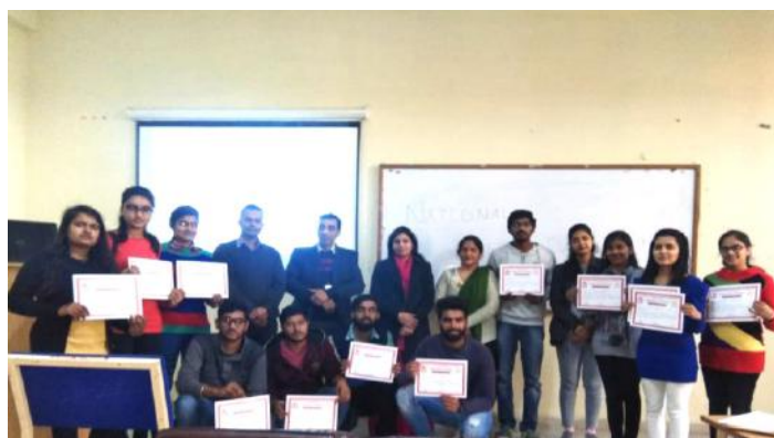
Victorious students of various competitions organised during the celebrations of National Science Day on February 28, 2019.