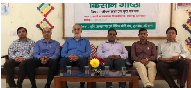
University dignitaries and staff members during Kisan Gosthi on March 30, 2019.