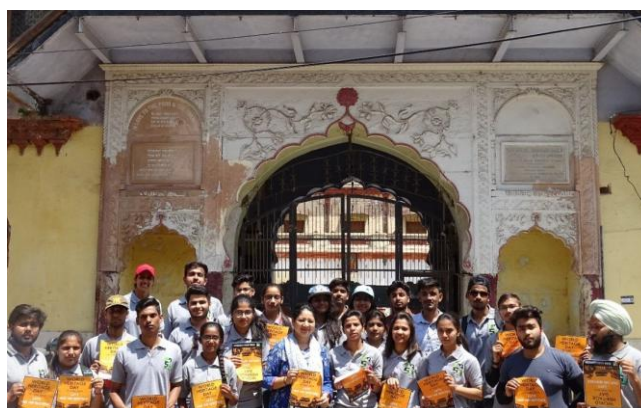
Students of MMSOA took a heritage walk during the World Heritage Day celebrations on April 18, 2019.