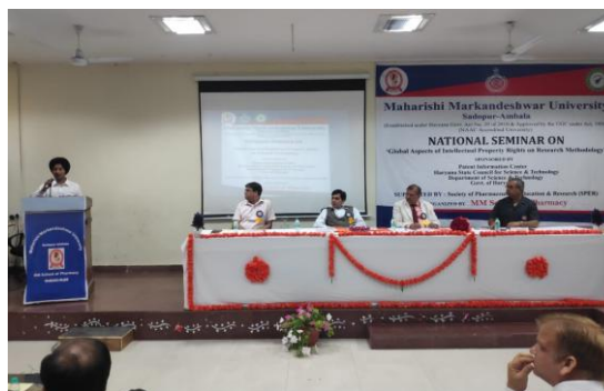
Delegates expressing their views during the National Seminar