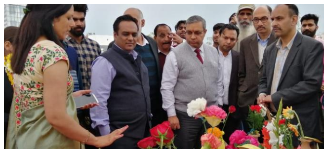
University officials and staff members during the flower show and competition on March 14, 2019.