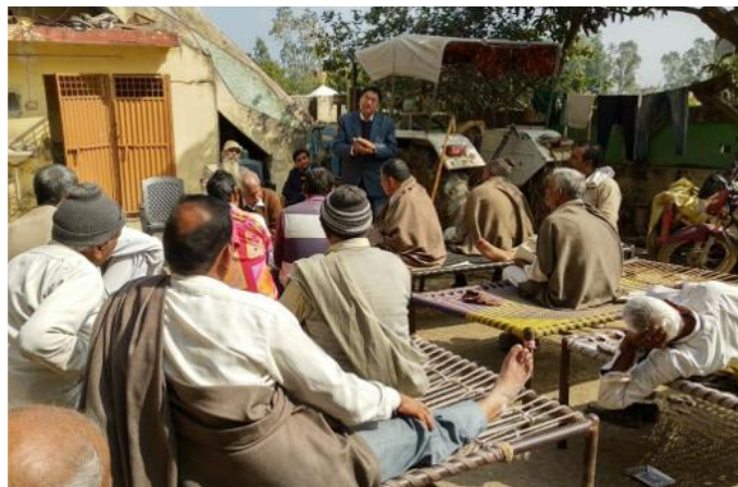
Faculty members of the Department interacting with farmers during Kisan Gosti on Feb 16, 2019