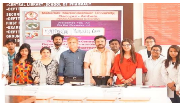
Students and faculty members of MMSoP during the Hypertension Day celebrations on May 13, 2019.