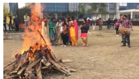
Lohri celebrations by MMSoP on January 13, 2019.