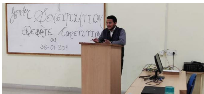
A student expressing his views during the debate on gender sensitization on January 30, 2019.