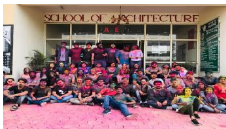
Holi Celebrations by the students of MMSoA on March 22, 2019.