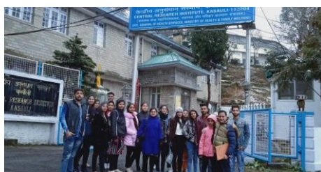
Students of the Department of Chemistry during their visit to Central Research Institute, Kasauli on February 27, 2019.