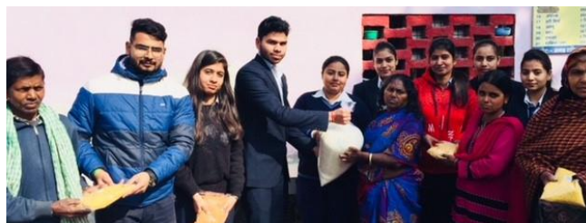
Students of the Department donating essential items to the residents of Kusht Ashram

The Management Society of Department of Management Studies organized a charitable activity and visited Pashupathi Nath Kusht Ashram, Ambala City on January 25, 2019. The students, along with the faculty members donated food items like wheat flour, rice, pulses and fruits to residents of the Kusht Ashram.