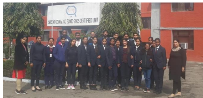
Students of the Department of Management Studies during their visit to Vita Milk Plant. on Feb 19, 2019

The students of the Department of Management Studies visited Vita Milk Plant, Ambala City on February 19, 2019. The visit was organised by the Management Society of the department. The students interacted with the managers and professionals at the milk plant and also learned various aspects of milk production and packaging. The students acquainted themselves with the complete production process of the milk plant i.e. from procurement of raw milk from co-operative farms to packaging and selling it to the end consumer. At the end of the visit, the managers of the milk plant interacted with the students and answered their doubts about various logistic issues regarding distribution of their products.