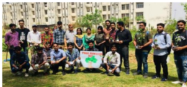
Students and Faculty members of MMSoP during the tree plantation drive on April 10, 2019.