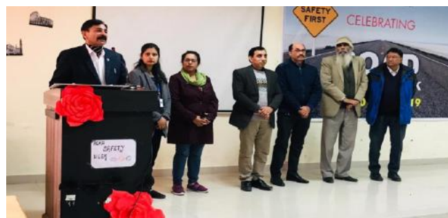
Dignitaries of University during the observance of National Road Safety week from February 4-10, 2019.