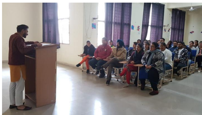
A student reciting poetry during Matribhasha Day Celebrations on February 21, 2019.