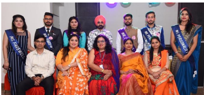
Students and Faculty members of the Department of Management Studies on the occasion of farewell party on May 10, 2019.