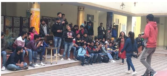
Students of MMSoA during the debate competition on March 06, 2019.