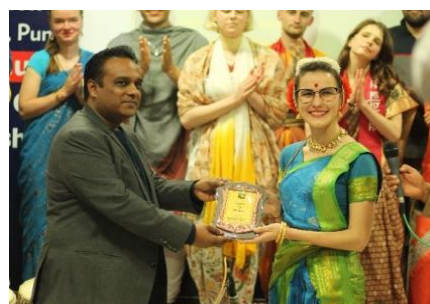
Glimpses of Musical cum Meditation Session- 'Yogadhara'