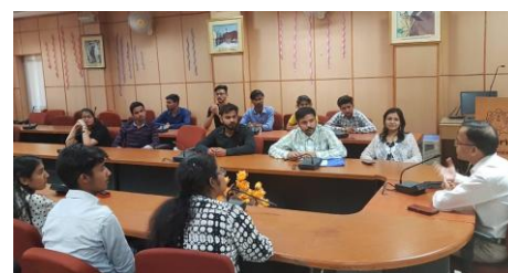
Students of MMSoP interacting with Industry experts during visit to NDRI-Karnal on May 07, 2019.