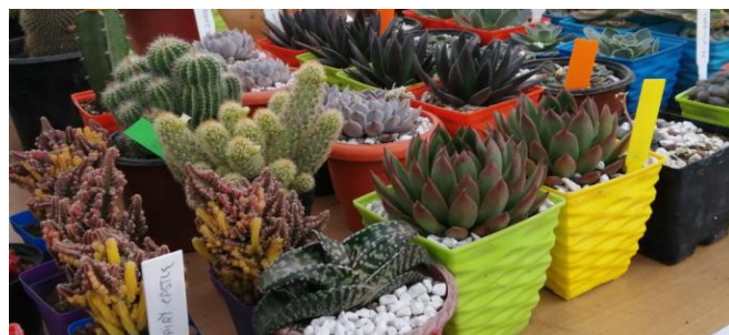
Plants on display during the flower show and competition on March 14, 2019.