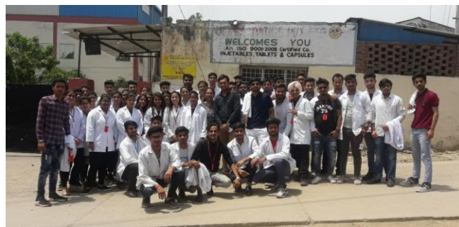
Students of MMSoP during industrial visit to Ultra drugs Pvt. Ltd. on May 2, 2019

The Industry-Institute Interaction Cell of Maharishi Marakandeshwar School of Pharmacy (MMSoP) organized an industrial visit to Ultra Drugs Pvt Ltd., Baddi for the students of the Department. The company is manufacturing oral solids – particularly tablets, granules as well as injectable formulations in their Baddi plant. During the visit the students familiarized themselves with equipment like fluidized bed dryer, automatic vial filling machines and lyophilizers along with brief introduction of various primary and secondary packing techniques.