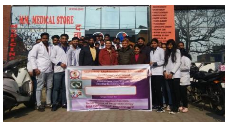
Students of MMSoP during their visit to the Capital Super Speciality Cancer Hospital on February 04, 2019